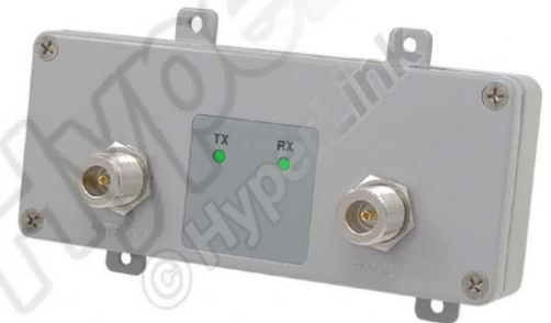
Indoor Model ("GX1" Version)