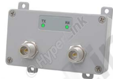
Indoor Model ("GI" Version)